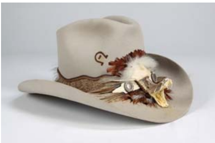
Lot 245: Larry Hagman Charlie Horse Cowboy Hat (Est. $600/$800)

From his trademark cowboy hat to his infamous lines on Dallas and his many charitable cause related endeavors, Hagman's properties span a legendary time when primetime television had you glued to your seat until the next episode. The collection of Larry Hagman offers fans and collectors a rare opportunity to own a piece of Hollywood history and personal items, each with its own story to tell.