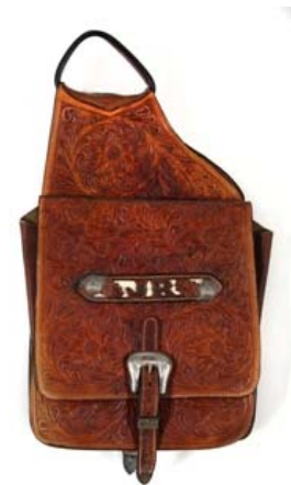
Lot 242: Larry Hagman Monogrammed "JR" Saddlebag (Est. $200/$400)

Choice memorabilia items include Dallas scripts (estimates ranging between $250 to $800), games, trading cards, photographs, instruments, and clothing. There are also a variety of awards and items representing Hagman's interests in various causes, including anti-smoking campaigns, organ donation, solar power, Harley-Davidson Bikers Against Diabetes, the Ojai Festival, and more.