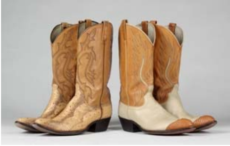
240: Larry Hagman Snakeskin Cowboy Boots (Est. $400/$600)

Highlights of the Hagman sale include an abundance of elegant furnishings from the hilltop estate Heaven , a spectacular property built by the Hagmans in 1991 overlooking the Ojai Valley. Highlights coming to the block include an 18 th century Spanish Colonial painting of the Madonna and Child (est $4000/$6000), an antique Italian credenza (est $3000/$6000), a Rosewood Regency drop leaf table (est $2,000/$3,000), a set of ten Chippendale style dining chairs with needlepoint upholstery (est $3,000/$5,000) a British Sterling Silver Lot tray (est $4,000/$6,000) and many pieces of modern and contemporary art including works by Rhonda Roland Shearer, Barton Benes, Bruce Killen, and Kristina Hagman.