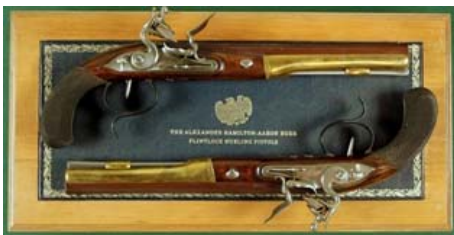
Lot 82: Hamilton-Burr Dueling Pistols (Est. $1,000/$2,000)